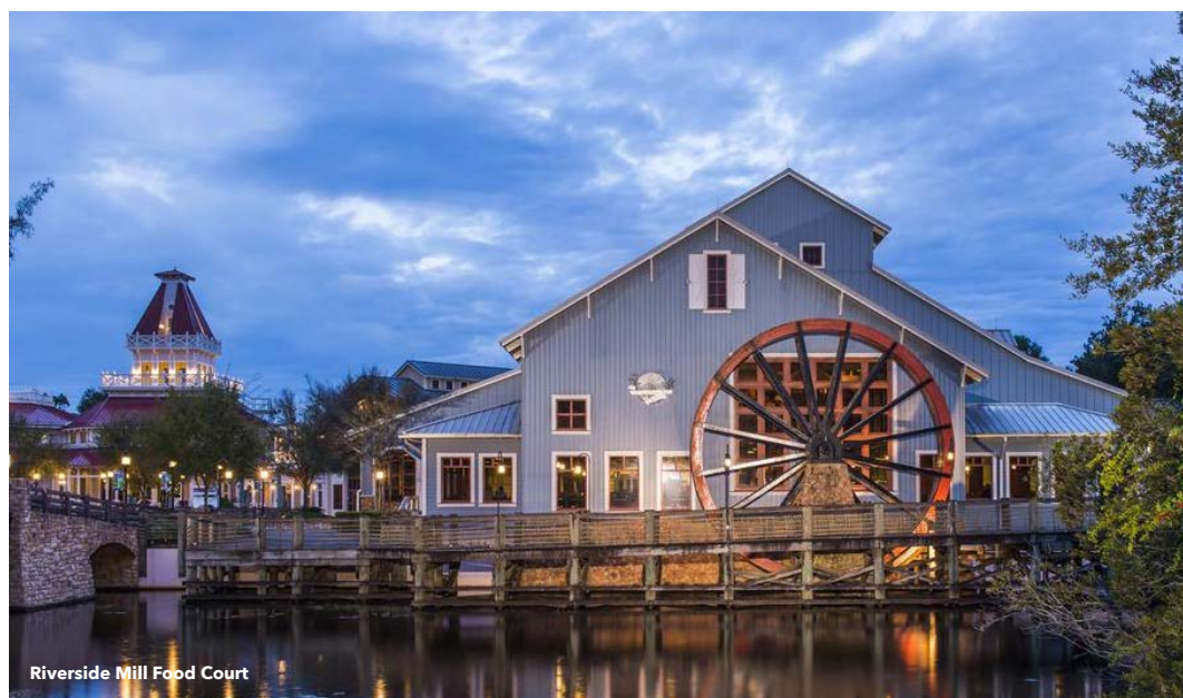
Riverside Mill Food Court

Discover true southern comfort at this charming lounge - a welcoming watering hole with live entertainment and a full bar.