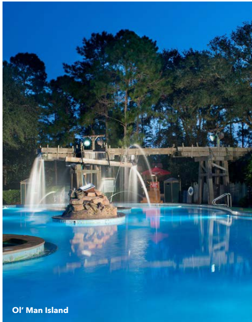
Ol' Man Island