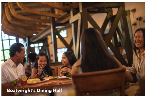
Boatwright's Dining Hall