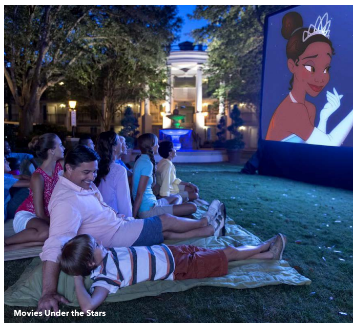
Movies Under the Stars