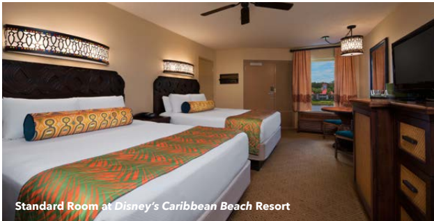
Standard Room at Disney's Caribbean Beach Resort

This Disney Moderate Resort celebrates the spirit of tropical locales—from the legacy of colonial forts and architecture to lively markets, exotic birds and relaxing strolls on the sand. Each island complex is bright, airy and colorful with access to a 45-acre lake and sandy beaches.