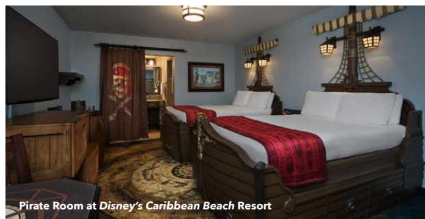
Pirate Room at Disney's Caribbean Beach Resort