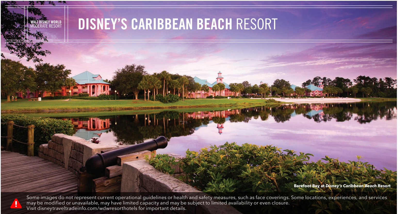
Barefoot Bay at Disney's Caribbean Beach Resort