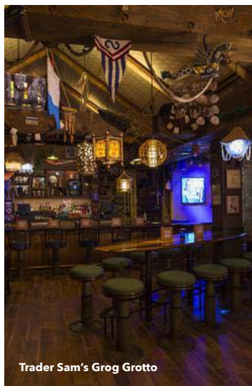
Trader Sam's Grog Grotto

Great Ceremonial House – Try a tropical drink at this tribute to the tiki god, featuring a full bar of libations and Hawaiian-inspired pupus.