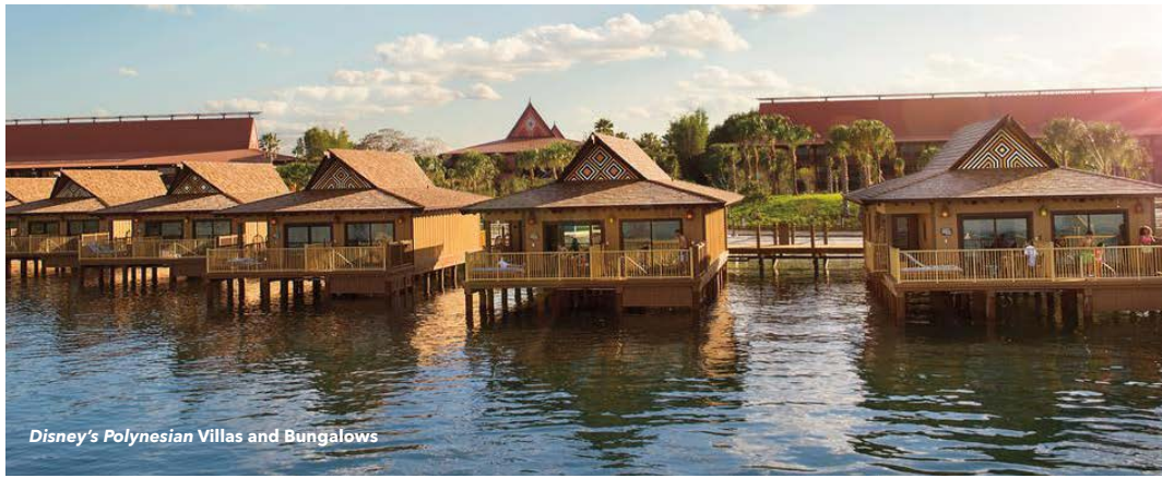
Disney's Polynesian Villas and Bungalows