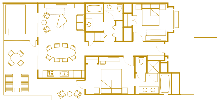
Bungalow , 1093 sq. ft. Accommodates up to eight Guests plus one child under age 3 in a crib.