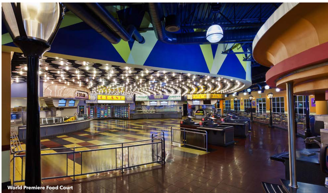
World Premiere Food Court