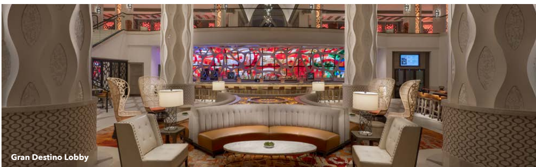
Gran Destino Lobby