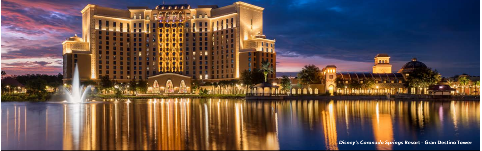
Disney's Coronado Springs Resort - Gran Destino Tower