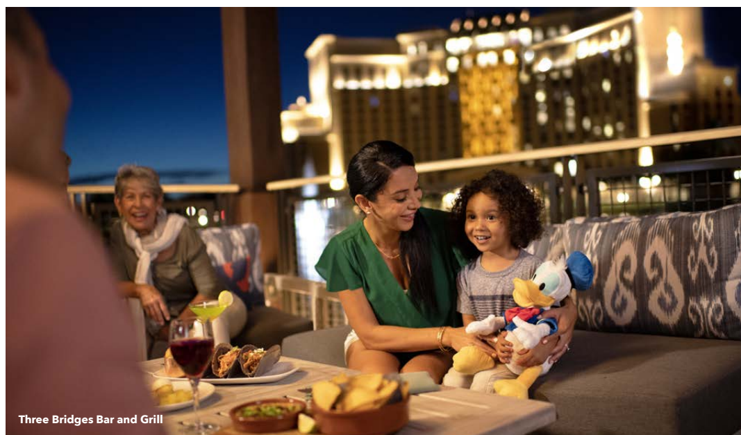
Three Bridges Bar and Grill

Savor espresso drinks, pastries and light fare, as well as cocktails, Spanish and California wines and American craft beers at this hybrid bakery-bar inspired by Spain's coffee and gin culture.