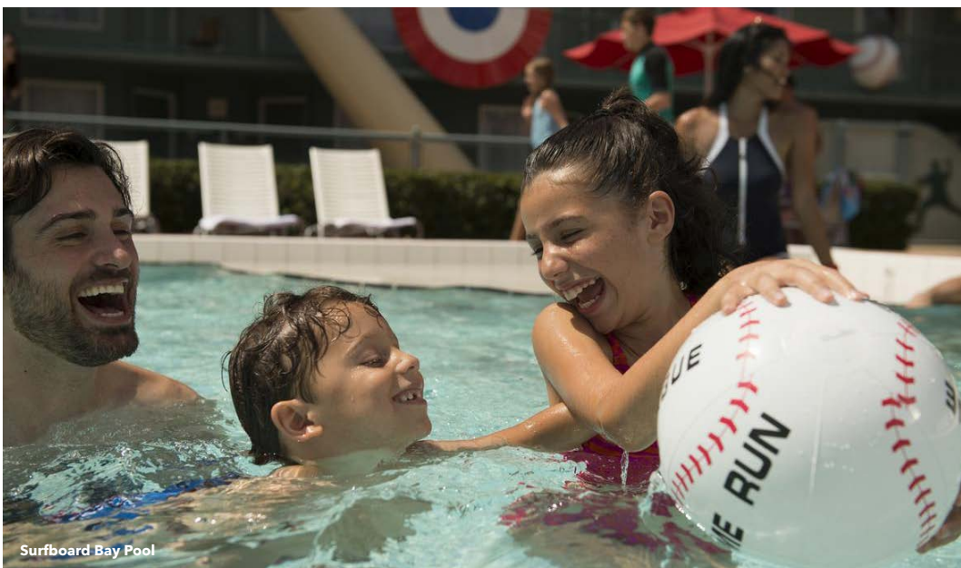
Surfboard Bay Pool