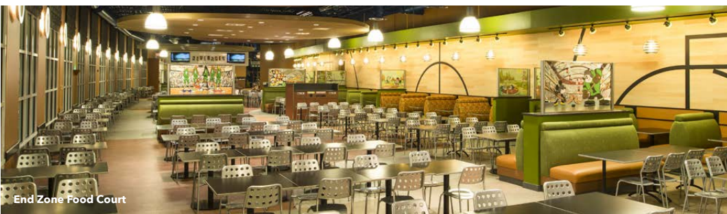
End Zone Food Court