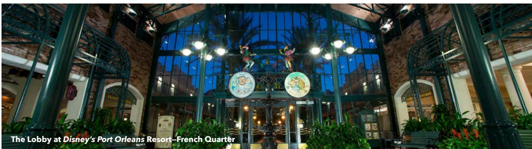
The Lobby at Disney's Port Orleans Resort—French Quarter